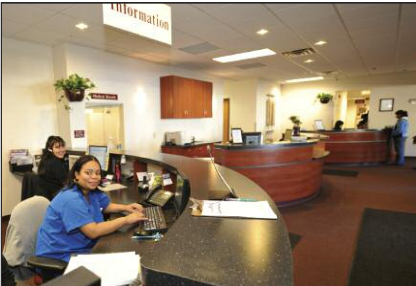
Newly remodeled patient services at Chavez Health Center.