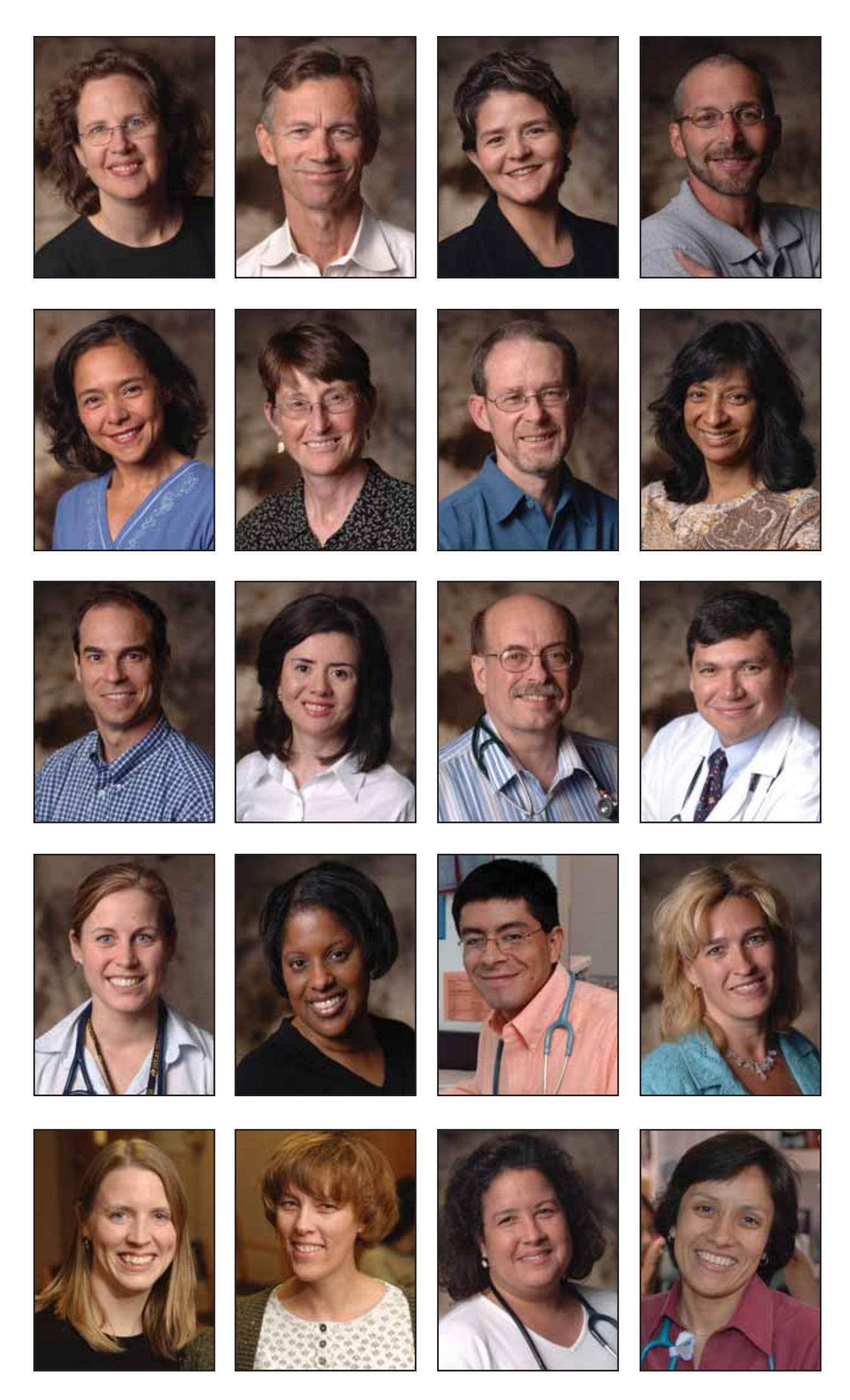
PAGE 22 SIXTEENTH STREET COMMUNITY HEALTH CENTER